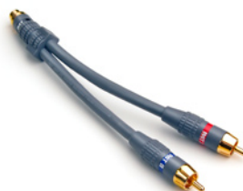
RCA Audio Y-connector

High quality gold twist-on style tool-free construction. These RCAs make a tight, signal-sure connection to your cables.