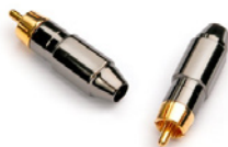
OneWire RG-59 twist-on RCA connectors

This high performance double shielded (95% copper braid over 20° overlap aluminum foil ) cable features silver-clad oxygen free copper (OFC) conductors and a gas injected dielectric that provides very low capacitance, extremely wide bandwidth and a very high (82%) velocity of propagation.