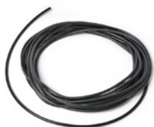
Up to 50 Ft. OneWire RG-59 coaxial cable

Eliminate the need to coil up and hide excess cable behind or under your equipment! This easy to use kit includes everything you need to make a quality subwoofer cable to your desired length. Uses a low capacitance, shielded cable for deeper, more articulate bass.